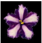
Black background www.chimeraav.com/wp-content/uploads/2012/01/FT4B.ico