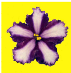
Yellow background www.chimeraav.com/wp-content/uploads/2012/01/FT4Y.ico