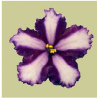
Green-gray background www.chimeraav.com/wp-content/uploads/2012/01/FT4G.ico