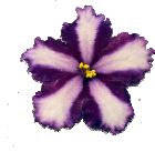
Transparent background www.chimeraav.com/wp-content/uploads/2012/01/FT4BT.ico

After you save the icon to a place on your computer you will easily find you can then substitute a typical “short cut” explorer icon or a fire fox icon with one of these. To do that, go to the properties area of the current short cut icons and by “right clicking” on the icon and select “change icon.” Then select browse and locate and upload your icon. Or for more permanency since most of those files are located in system 32 you can drag and drop the icon there and then locate it in the “browse function”, “select”, then click “apply” and “OK”. You now have Chimera African violet icons on your PC.